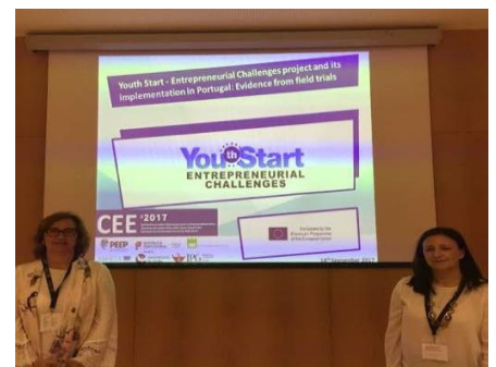
CEE' 2017 “Conference on Entrepreneurship Education” (Aveiro, Portugal)

Two of the senior teacher trainers attended an international Entrepreneurship Conference held at the University of Aveiro, on the 14th September 2017, the CEE' 2017 “Conference on Entrepreneurship Education”. The trainers from PEEP and co-authors presented the paper "Youth Start - Entrepreneurial Challenges project and its implementation in Portugal: Evidence from field trials". During the event, they've had the chance to discuss the state of the art in terms of Entrepreneurship Education with several organisations and get feedback on the trials and the research methodology of the project.