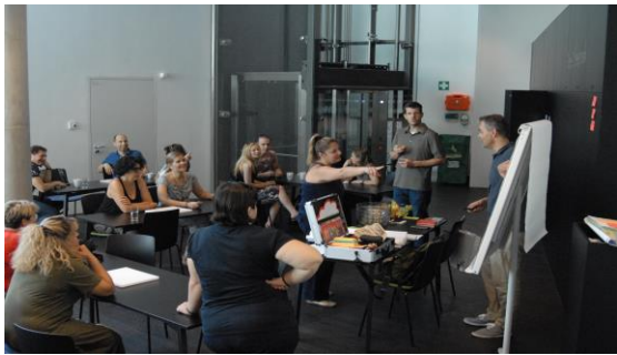
Teacher training Seminar “Become an Entrepreneurship Educator (Vienna, Austria)

Now, more than ever, I am ready to make the move from traditional teaching to project-based learning helping my students develop their creativity, ability to generate ideas and turn them into action, learn to work in a team, take initiative and accept responsibility. As Albert Einstein once said, «If you always do what you always did, you will always get what you always got».”