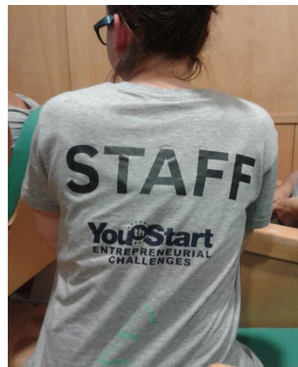
You th Start student staff at a Portuguese school.

Two of the most popular challenges from You th Start Project were, Start Your Project and Open Door B2 Challenges due to the wide range of themes and activities they promote and the opportunities they offer to youngsters to express their creativity, collaborative work, turning their ideas into practice.